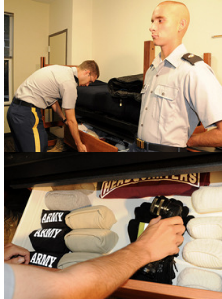
Cadet inspections in Patriot Hall

The university is planning to build another cadet residence hall to replace Simons Hall and to renovate Gaillard Hall.